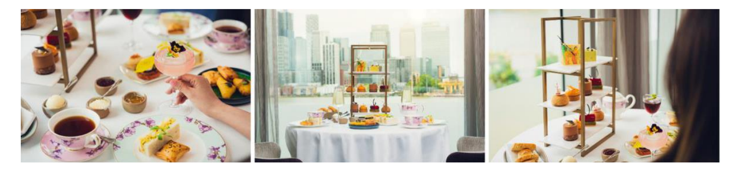
'Chai By The Shore' Afternoon Tea created by 2024's winning team of Bake Off: The Professionals

InterContinental London – The O2 is thrilled to announce its Indian Inspired Afternoon Tea, 'Chai By The Shore'. Designed by this year's Bake Off: The Professionals winners, the afternoon tea combines traditional Western techniques with the rich, aromatic flavours of Indian cuisine, for an afternoon tea experience like no other. The exclusive afternoon tea is served at the hotel's fine dining restaurant, Kinaara, which offers breath-taking views of the River Thames and Canary Wharf.