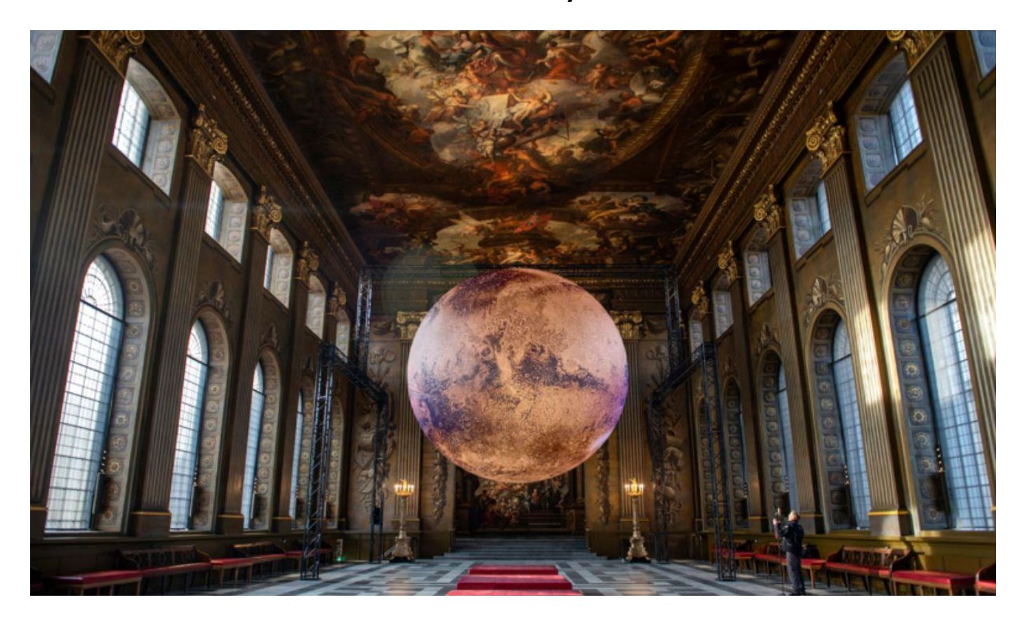
© The Painted Hall, Old Royal Naval College

Make it your mission to see Luke Jerram 's astonishing installation Mars at the Old Royal Naval College . Following the sell-out success of Jerram's works Gaia and The Museum of the Moon , Mars is the third of Jerram's out-of-this-world installations at the iconic Old Royal Naval College in Greenwich. Visitors will be awed by the spectacle of the Red Planet, recreated to scale and installed against the magnificent backdrop of the Painted Hall, often referred to as 'Britain's Sistine Chapel'. This unique pairing brings two breathtaking works of art together, merging science with history and myth.