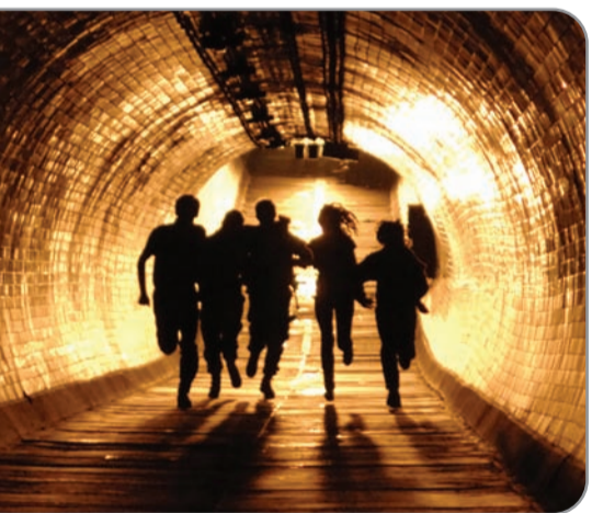
28 Weeks Later

A successful criminal, played by Daniel Craig, gets two tough assignments from his boss on the eve of his planned early retirement. Greenwich Park was used in the scene when Craig stands beside the Statue of General Wolfe and fails to assassinate the Serbian Hitman. Filming also took place on the Thames River Path in east Greenwich.