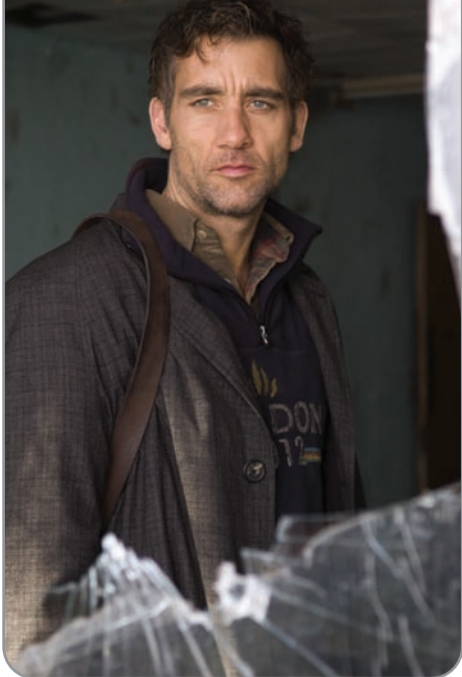
Children of Men

Filed partly on location in Watergate Street , 'Fly Boys' is set during World War I and focuses on a group of young Americans who volunteer for the French military before the U.S. enter the war and subsequently become the country's first fighter pilots. Crowley's Wharf was also used as a location to recreate a dockside scene, set in New York, during the war.