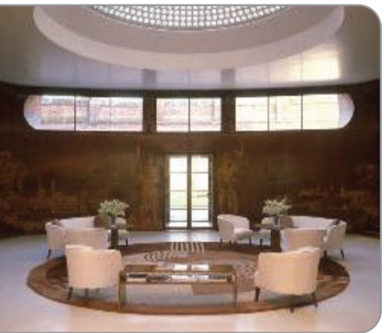
Eltham Palace Entrance Hall

When a Russian teenager dies in childbirth, Nurse Anna is determined to track down the family and save the baby from foster care. The girl's diary leads her to the bloody underworld of the Russian Mafia. Directed by David Cronenberg and filmed on location at the Watergate Street and Old Royal Naval College in Greenwich.